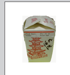
Food Pail PT 500 x 16 oz FOLD PAK