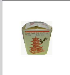
Food Pail 1/2 PT 500 x 8 oz FOLD PAK