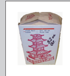
Food Pail QT 500 x 32 oz FOLD PAK