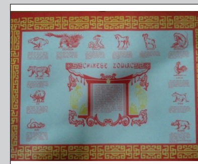
Place Mat Zodiac 9x13 KARI-OUT