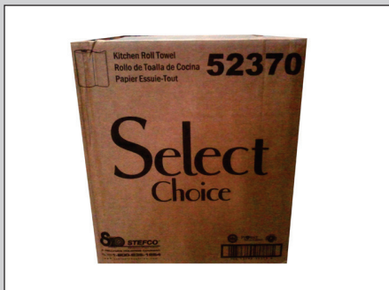
Paper Towel Household S CHOICE