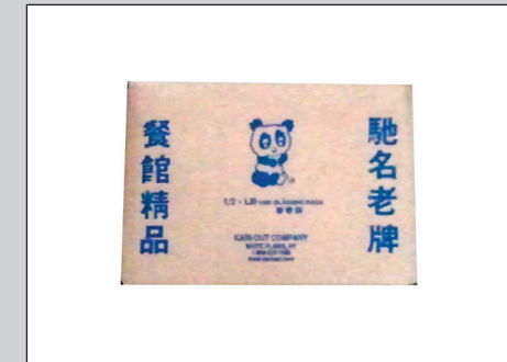
Glassine Bag KARI-OUT