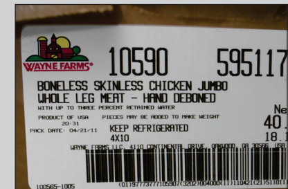
Leg Meat Fresh-BB CVP 40 lbs.