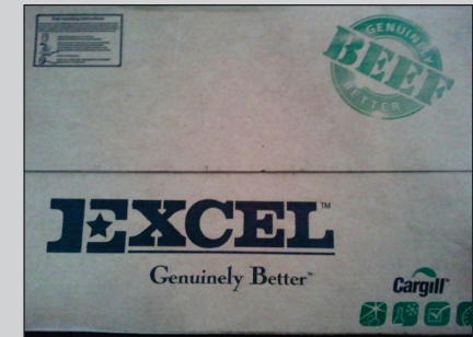
Flank Steak EXCEL