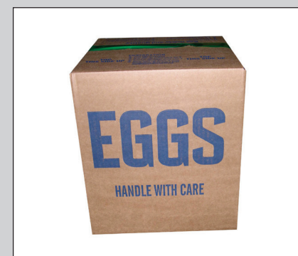
Eggs - XL Grade A 15 doz