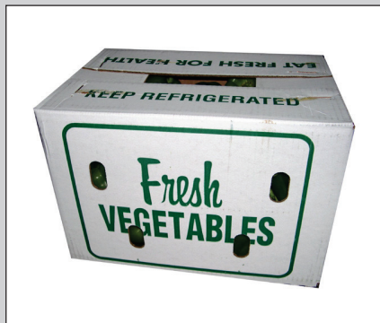
Green Pepper (Case)