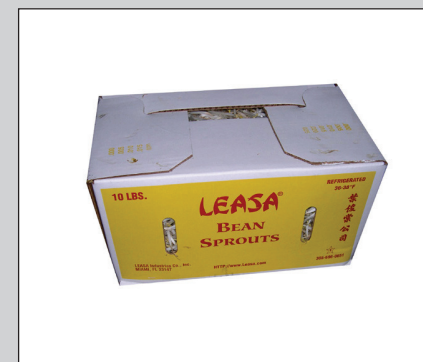
Bean Sprouts (Case)