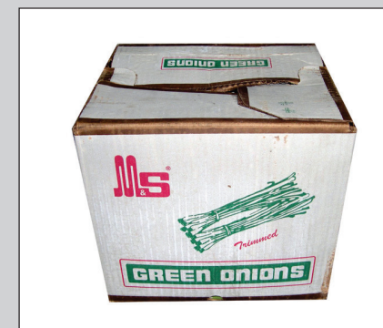
Green Onion (Case)